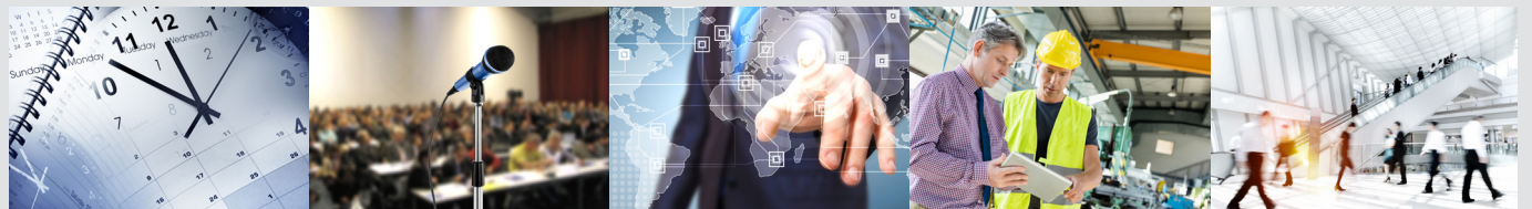
Time & Attendance